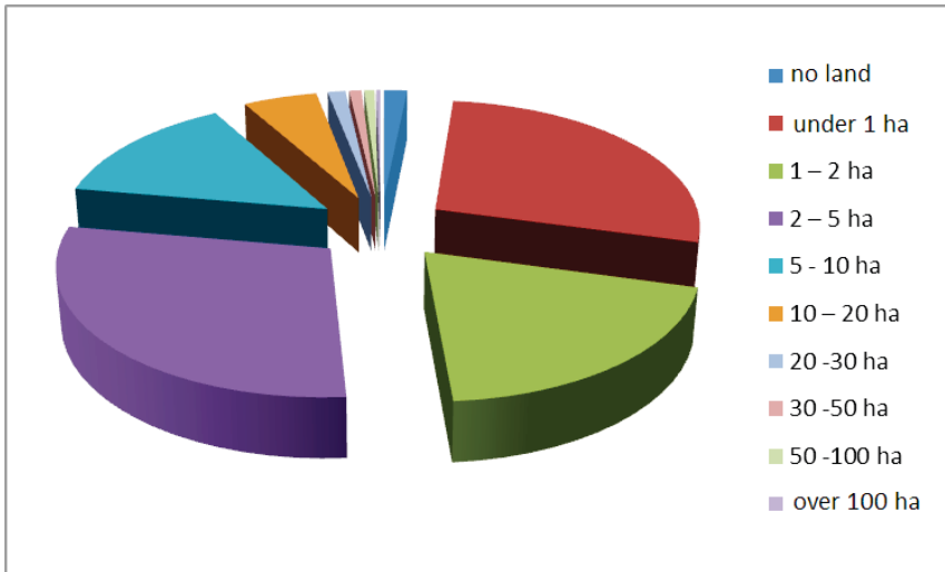
Figure 1. Possessory Holding Structure in the Republic of Serbia