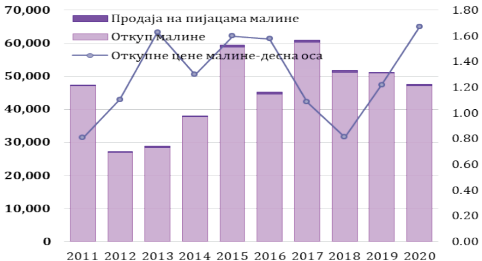
Graph 2. Purchase of raspberries and sales at markets